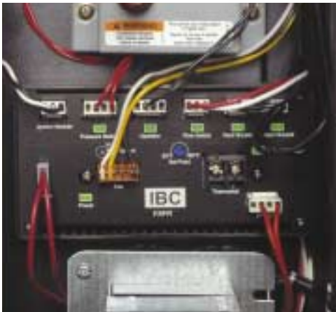
Power Supply/Connector Bus